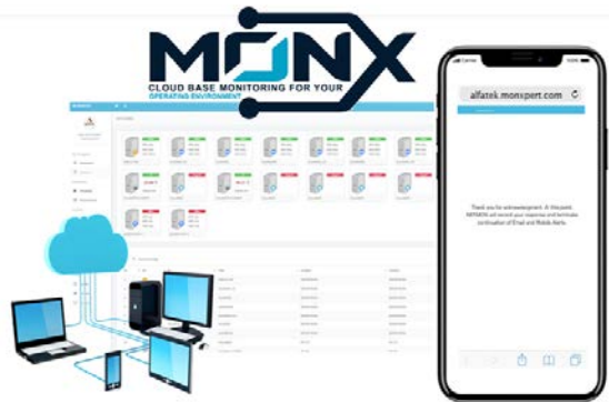
All-in-one device and infrastructure monitoring platform